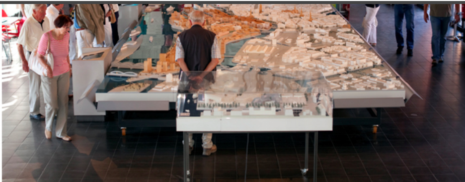
Model of the HafenCity Hamburg in the Information Center.

The HafenCity Hamburg GmbH also hosts an extensive website, orchestrating historical analysis, accounts of technological change, and announcements of future development into an intricate description of past, present, and future. It showcases HafenCity as Europe's largest urban redevelopment project; an organization with a forward looking agenda; and a company that responds to local and global expectations and social and environmental concerns [6]. The website is