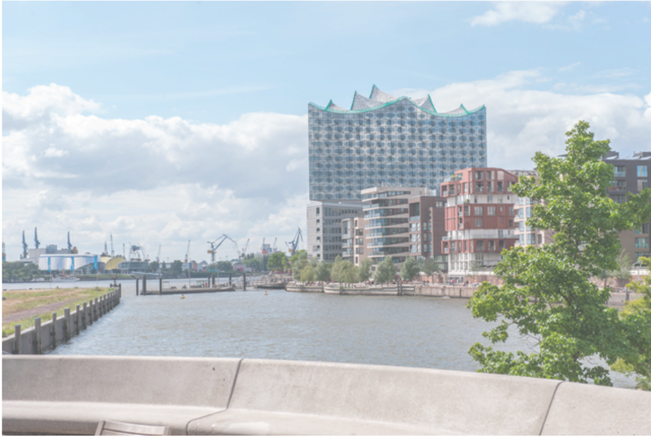
The Elbphilharmonie in the HafenCity Hamburg – one of the buildings where the construction progress can be tracked through a webcam.

carefully designed to attract a broad group of users, from investors to the general public, providing free access to extensive and varied documentation. It also features four webcams on ongoing construction projects (the Baakenhafen, the Campus Futura, the Elbphilharmonie and the Traditional Ship Harbour) and a ship radar tracking ships in real time, using technology to let users virtually visit the waterfront [7].