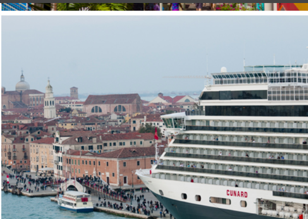
Photos of cruiseships in St. John's, Antigua, and in front of historic Venice, posted on community-based website of stock photographs.

Furthermore, the number of historical novels located in port environments and in shipping circles in